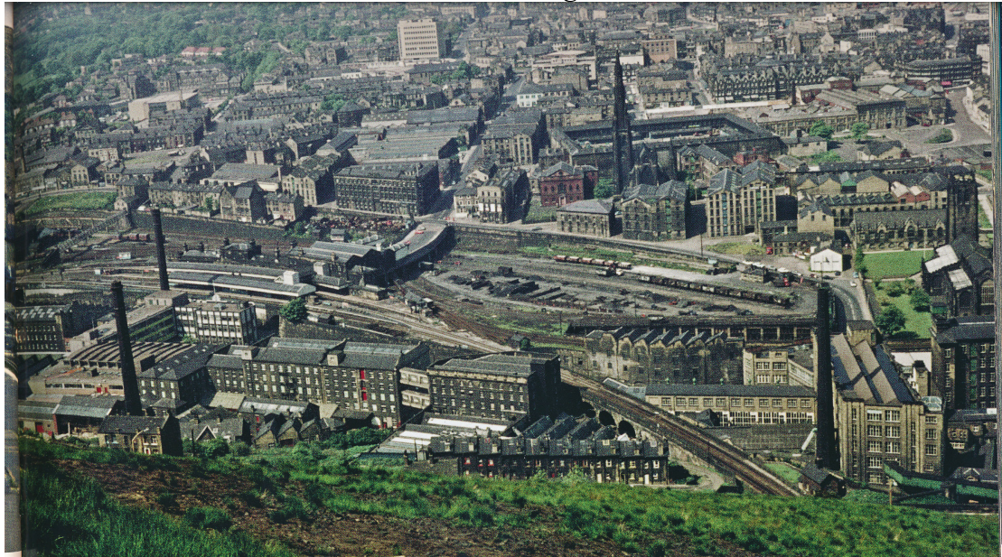
Halifax-June 1969

Halifax was famous for its cloth trade dating back to the 15th Century. The Piece Hall which we will see has recently been restored. It was where the woollen merchants brought their cloth for sale. The Town Hall was designed by Charles Barry who also designed the Houses of Parliament. Halifax is known for Mackintosh's chocolate and toffee including Rolo and Quality Street. The factory is still adjacent to the station. The saying from Hull, Halifax or Hell, comes from its reputation for harsh punishment including the use of a guillotine until 1650.